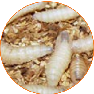
Magnified mature larvae