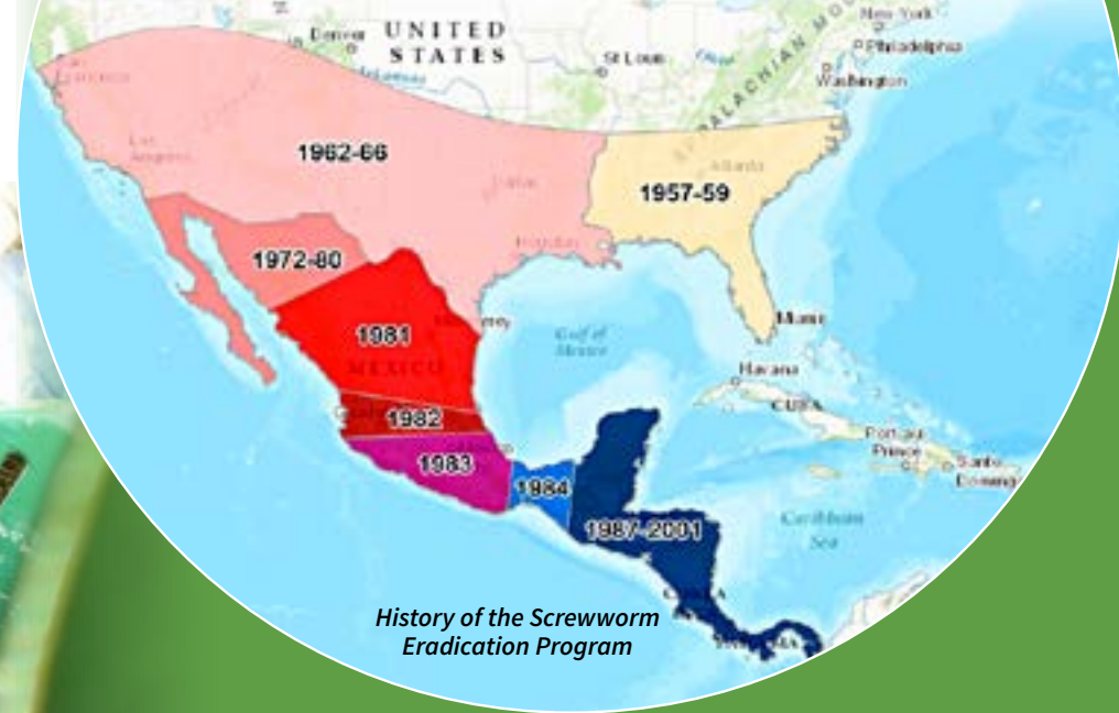
History of the Screwworm Eradication Program