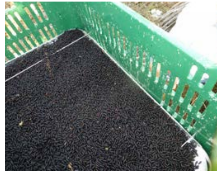
Sterilized NWS pupae released in infested area

To eradicate NWS, sterilized pupae may be placed in chambers at strategic locations throughout an infested area. Sterile flies may also be dispersed from aircraft over larger areas. As male flies emerge from the chambers, they seek out mates. Because female screwworm flies mate just once in their lifespan, the only eggs they will lay are not viable and will not develop into maggots. The population ultimately dies out as more sterile screwworm flies are released. The population of fertile screwworm flies dies off naturally over a few life cycles.