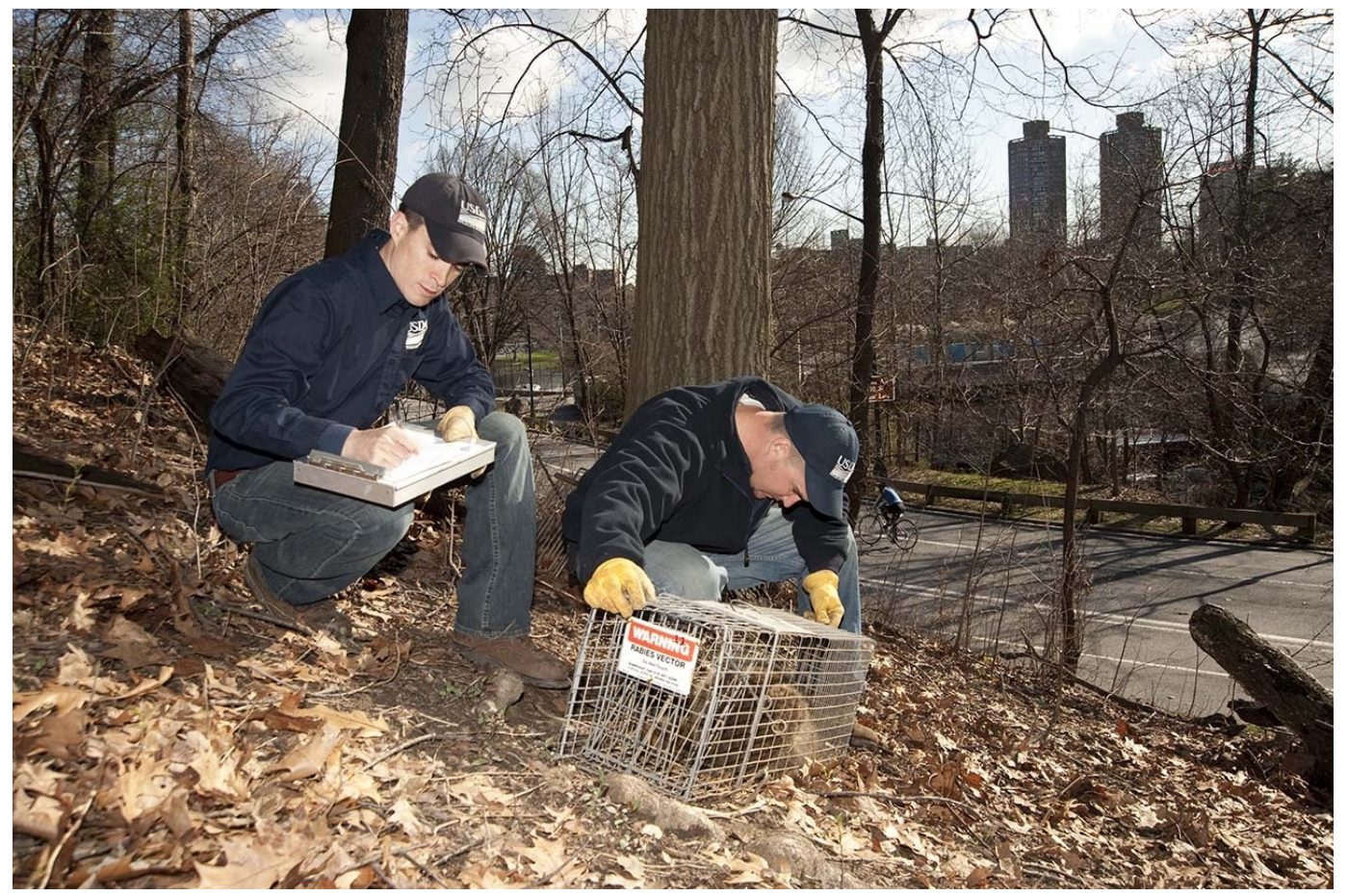
Factsheets, Brochures, and Other Outreach Products

Browse APHIS factsheets, brochures, and other outreach products to learn about our work, regulations, and agricultural pests and diseases.