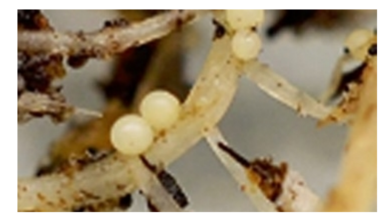
LM Dandurand, University of Idaho

The pale cyst nematode ( Globodera pallida , PCN) is a soil-dwelling roundworm that feeds on the roots of high-value crops such as potatoes, tomatoes, and eggplants. PCN is native to South America and was discovered in Idaho in 2006. This pest can remain dormant and viable in soil for 30 years.