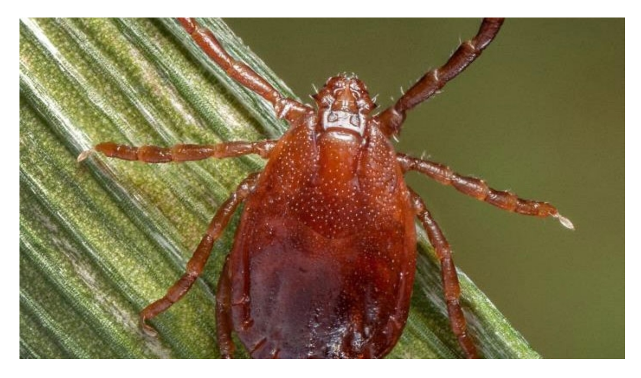
Adult female Asian longhorned tick on a plant stem

Asian longhorned ticks ( Haemaphysalis longicornis ) are invasive pests that pose a serious threat to livestock in the United States. They can form large infestations on one animal and spread diseases that impact both animals and people.