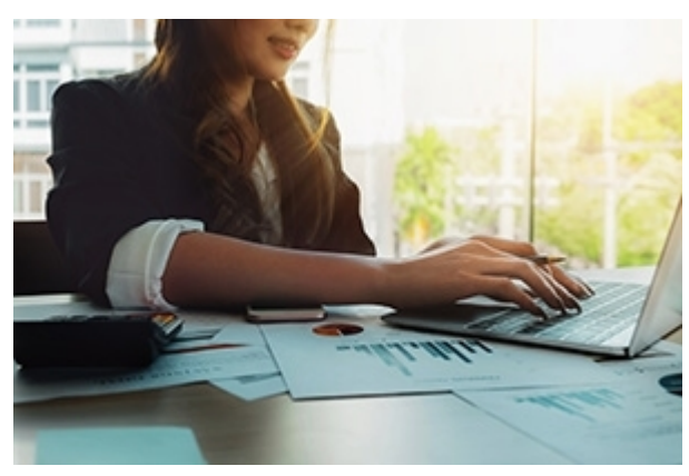
Privacy Act Resources

Requests for access to Privacy Act records must be in writing in accordance with the instructions set forth in the system of notice for that system of records.